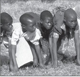
Children at kids club in Ngulilo line up for a race.

HIV and AIDS prompted the declaration of a national disaster in Tanzania, and the epidemic is a top government priority development issue. AIDS has contributed to declines in life expectancy and gross domestic product and productivity, as well as increased infant and child mortality, poverty, household dependency ratio, and absolute number of orphans ( TACAIDS, NBS & ORC Macro, 2005 ). The Joint United Nations Programme on HIV/AIDS (UNAIDS) estimates that 6.5%