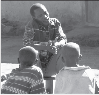
A Mama Mkubwa volunteer provides encouragement to a family during home visiting in Shilanga.

Community volunteers and TSA staff have identified a number of lessons learned through program implementation; they have tested various innovations and experienced successes and challenges.