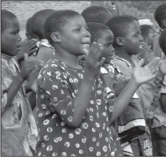
Children at kids club in Ngulilo play games led by Mama Mkubwa volunteers.

By 2010, TSA aims to serve 40,000 OVC through the establishment of 300 committees in Tanzania. TSA supports the DSW's action plan for OVC, which includes creation of MVCCs to address the needs of vulnerable children and families ( GOT MoHSW, 2006 ). As such, TSA will align community mobilization and training efforts with the plan and work to create and support MVCCs in new program areas, rather than creating parallel Mama Mkubwa committees. During the initial years of operation, Mama Mkubwa