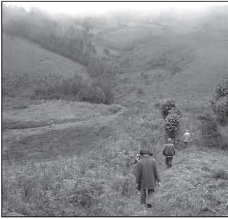
TSA supervisor and Ngulilo Mama Mkubwa volunteers on a journey to conduct home visiting.