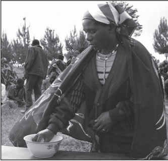
During community counseling at a village meeting in Ngulilo, community members donate money to the Mama Mkubwa committee to assist guardians caring for orphans and vulnerable children.

The Mama Mkubwa Program draws upon resources and contributions of donors, staff, community volunteers, and community members to address the needs of OVC and their families.