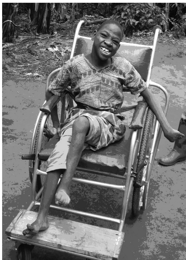
A wheelchair recipient in Karagwe district.

HIV/AIDS prevention education is provided to MVCC members and community volunteers to