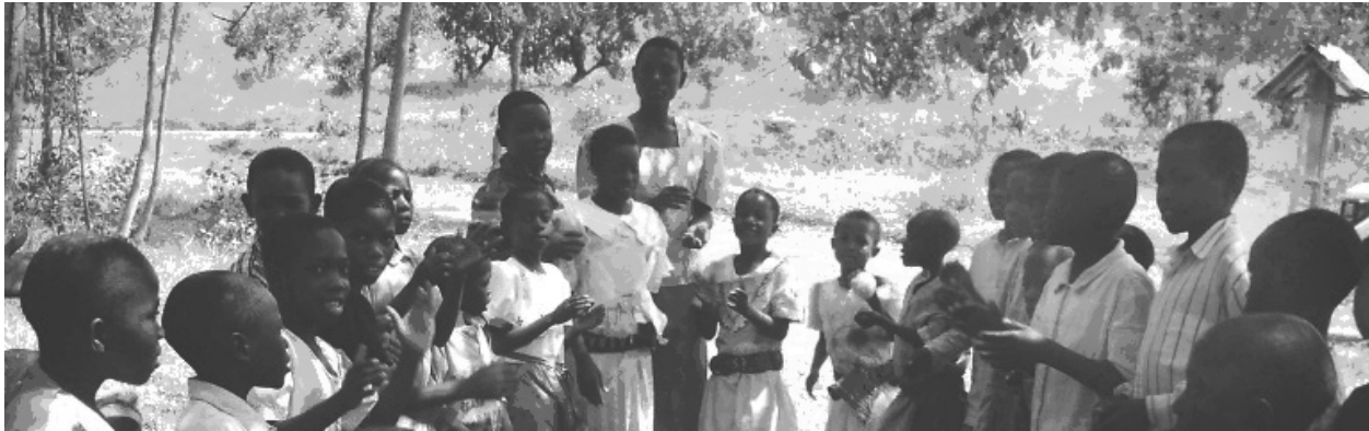
Rafiki Mdogo Club members in Katanda village of Karagwe district sing traditional songs as an activity.